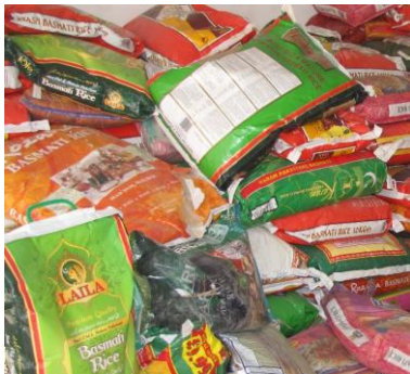
Recently unloaded rice in storage

In Jordan the Religious Freedom Coalition works with numerous ministries. One of those operates a very nice bookstore and coffee shop in Amman. The shop is well known in the entire Middle East for Christian and other quality books. Americans visiting Jordan from Iraq stop at the store to purchase books to take back with them. The store also fills orders for books throughout the Middle East. The store is a ministry and not a for profit enterprise. Indeed revenue from the store assists other ministry efforts including relief efforts to poor Jordanian and Iraqi Christians.